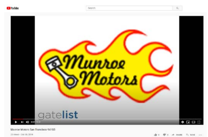
Munroe Motors San Francisco 94103 https://www.youtube.com/watch?v=Iqtz5_IRVoI Published on Dec 30, 2014 Posted by <u>GateListSF</u>

"Munroe Motors is San Franciscos oldest motorcycle shop, but that doesnt mean were outdated! We keep up with the latest models in European bikes, as we are an authorized dealer of Ducati, Husqvarna, Moto Guzzi, MV Agusta, Norton, and Triumph motorcycles. We have new and used motorcycles, as well as all of the parts, accessories, and apparel you need to have a safe and stylish ride. Our service department is second-to-none and all of our staff members are experienced riders. Munroe Motors provides you with the best in selection and service for European motorcycles. Stop by the shop today! Munroe Motors (415) 802-2910"