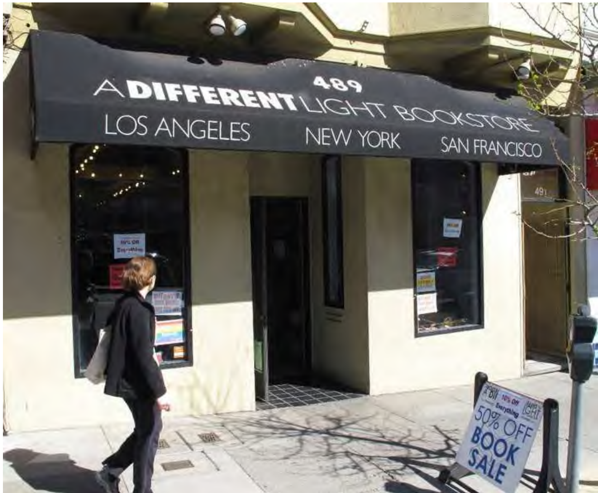
489 Castro when it was A Different Light, in 2011.