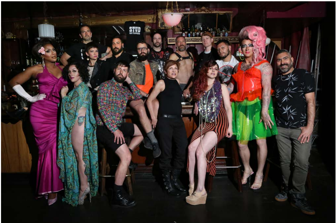
The Stud Collective, May 2017.

4 The nomination for Real Food Company was rescinded by the nominator after the Legacy Business was placed on the Registry. Rescinding a nomination after placement on the Registry does not remove a Legacy Business from the Registry.